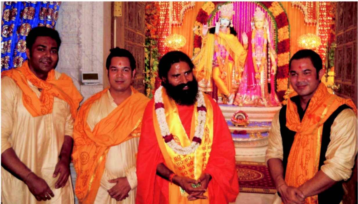
Yoga Guru Baba Ramdev , visited Prem Mandir in Vrindavan. In admiration of the Prem Mandir he said that it was unmatched to any other building and a visit to the Prem Mandir gives him a lot of peace.