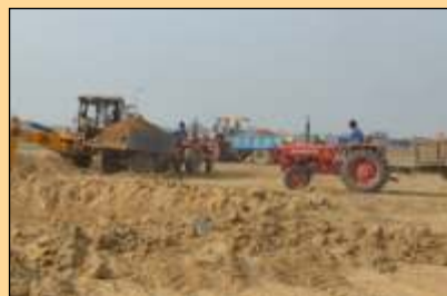
Apartment mining work