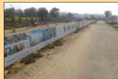
Approach Road- Base complete