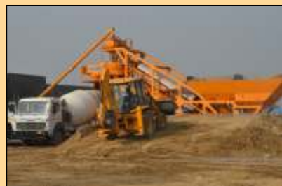
Batching Plant on Site