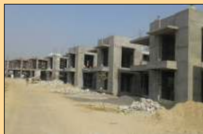
Shyam Kutir Villas - Work in progress