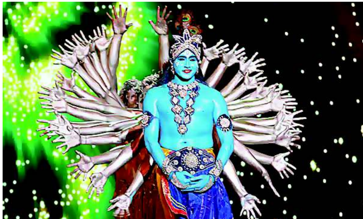
A cultural performance during Mathura Mahotsav, April 2015