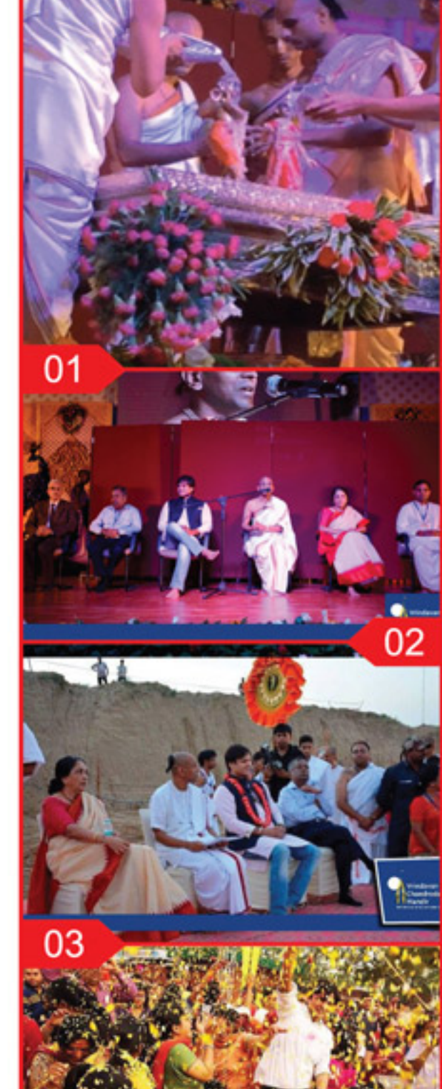
Celebrating the Birth of Lord Shri Krishna at Vrindavan Chandrodaya Mandir