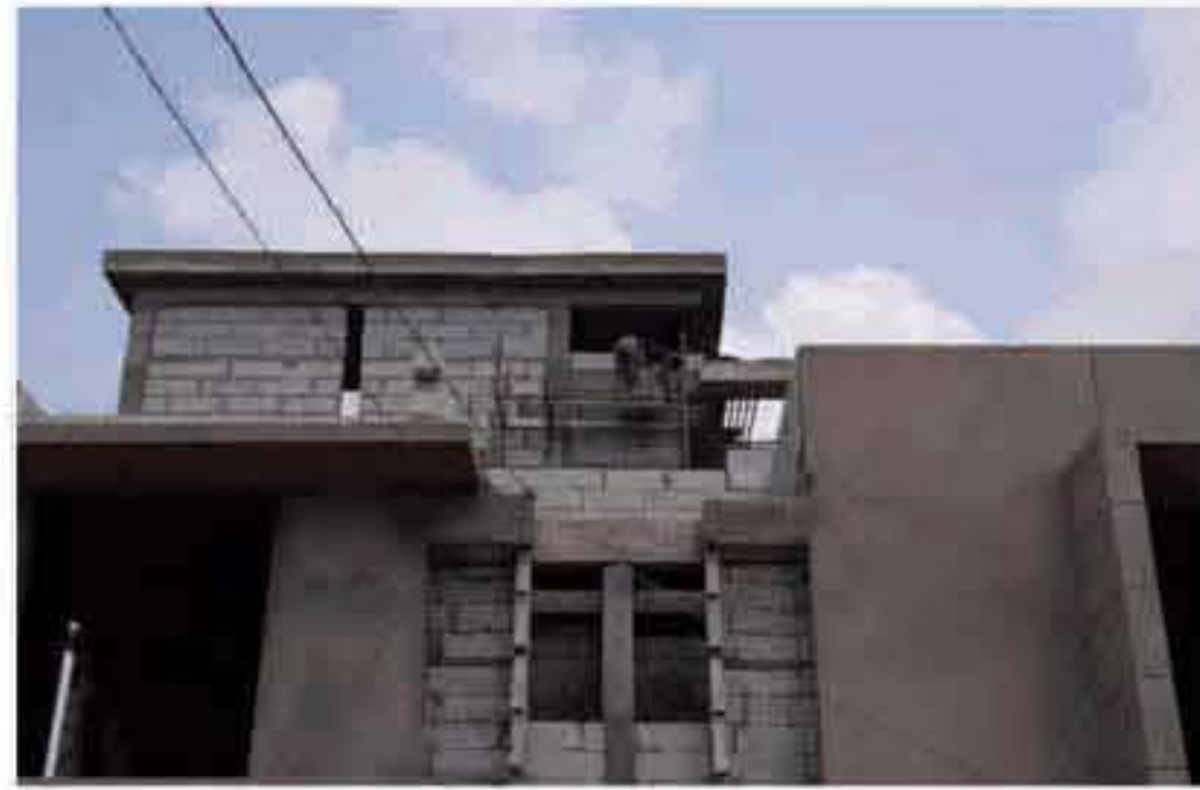
AAC Block work in progress in A6 mumty