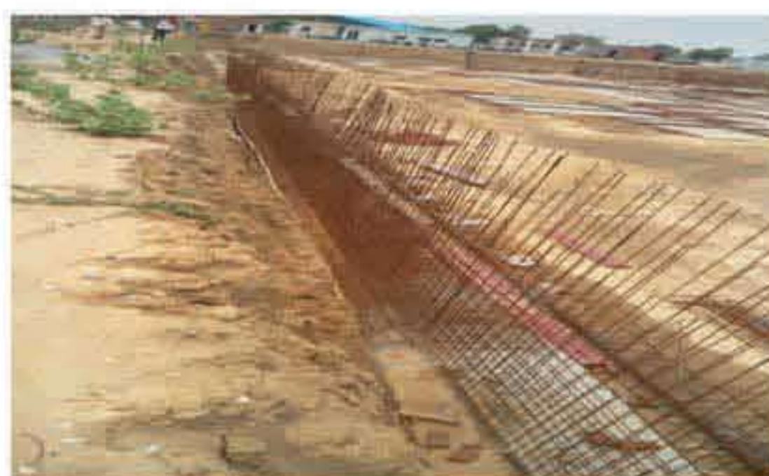
Retaining wall reinforcement work in progress