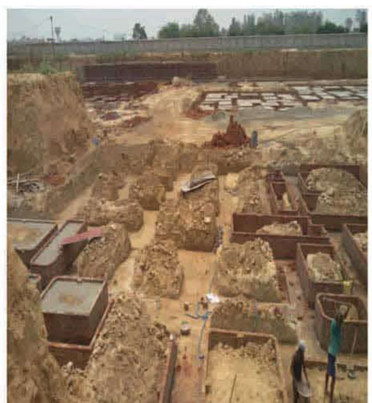
E(3BHK) Tower (T10 E02 & T11E01) Excavation work in progress