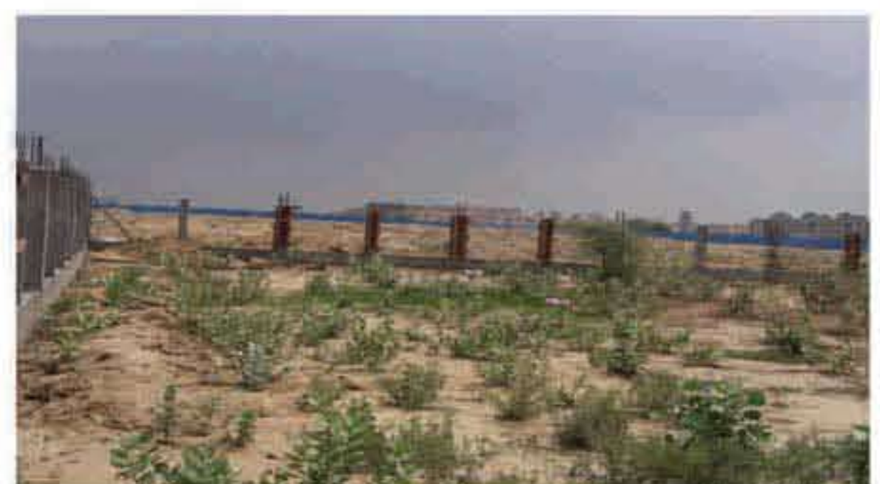
Boundry wall plinth beam and column RCC work in progress