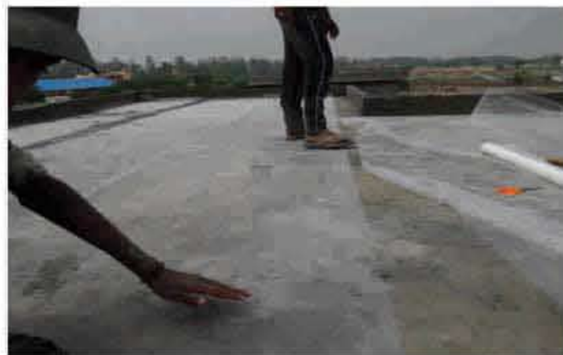
Waterproofing curing work in progress in A1 villa