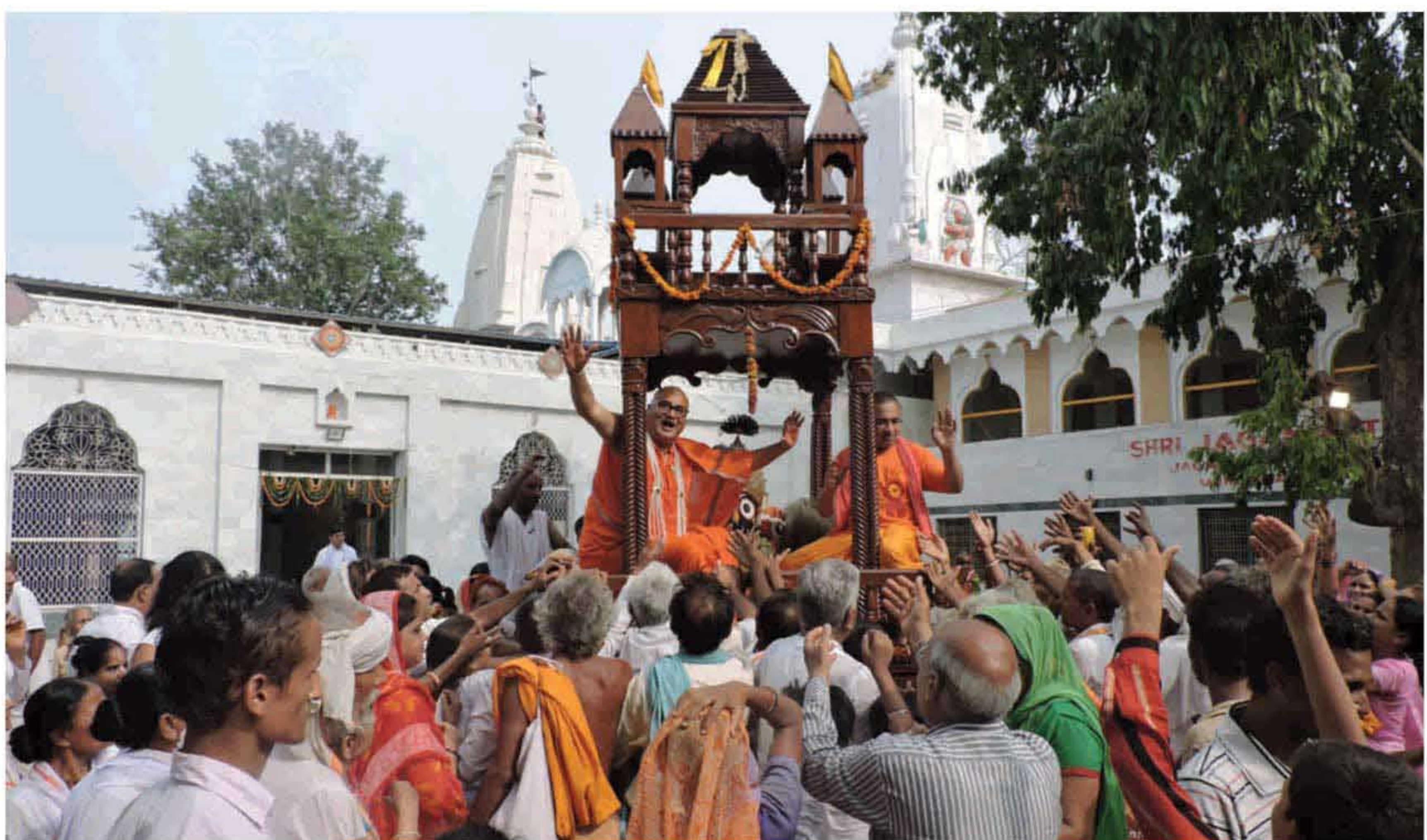
Lord Jagannath's procession in Vrindavan on the occasion of Rath Yatra