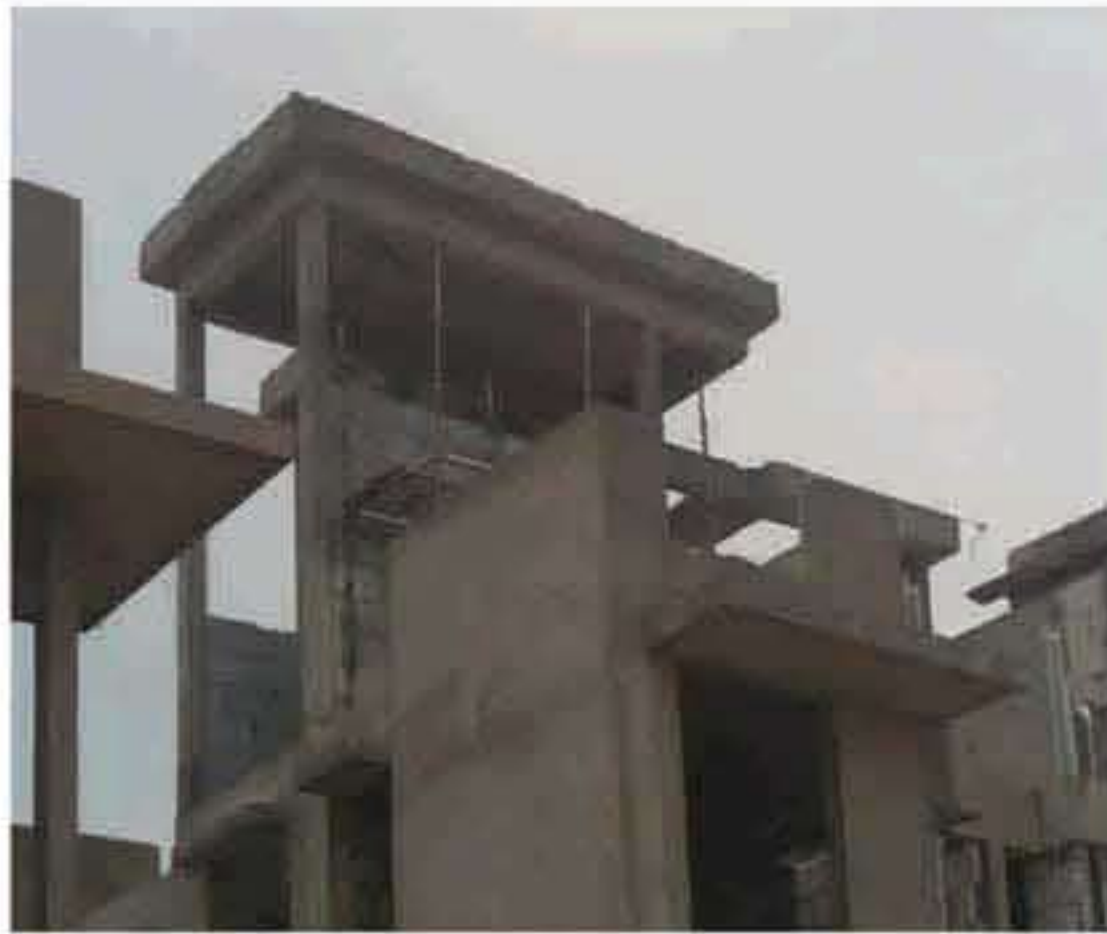
A10 mumty slab RCC completed