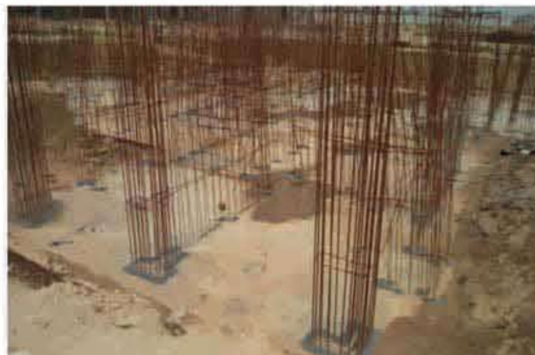
D(3 BHK) Tower (T9D01) Column & Wall layout work in progress