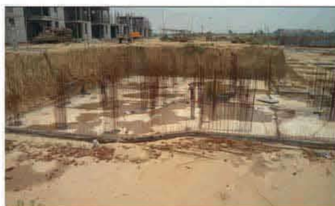
G(Studio) Tower (T1G01) Column & Sheer wall layout work in progress