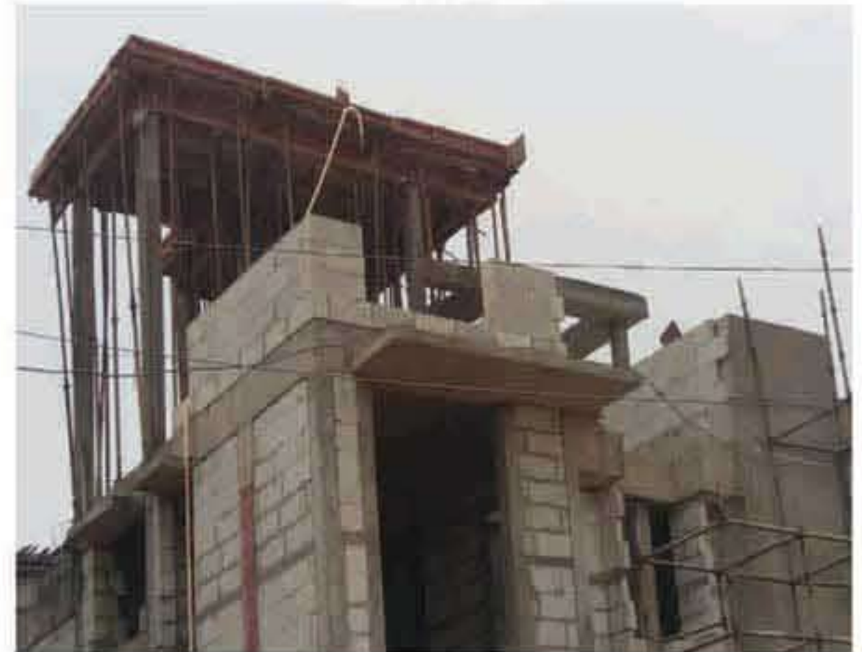
Block work in progress in A7 villa mumty