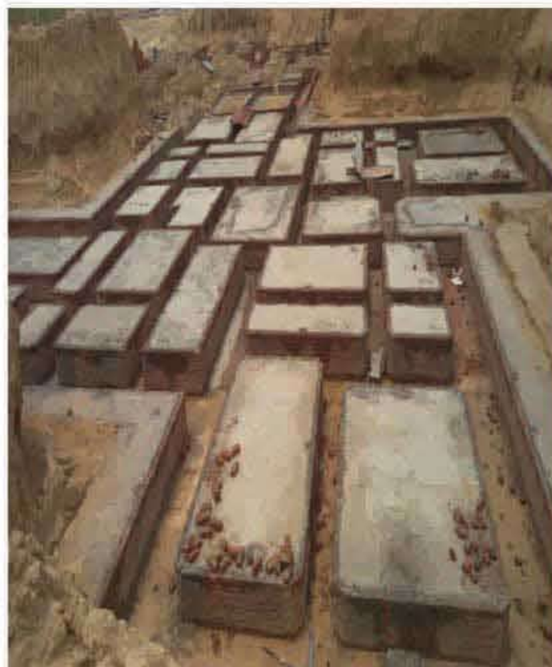
E(3BHK) Tower (T10 E02 & T11E01) Foundation PCC completed