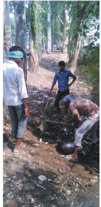
These are real images of the cleaning in process

Ankit Bagaria, a senior executive of the Infinity Group confirmed that along with cleaning of the roads, the joint effort will also extend to installing garbage bins, providing an alternative for garbage disposal, planting of trees as well as putting up benches for commuters and pedestrians.