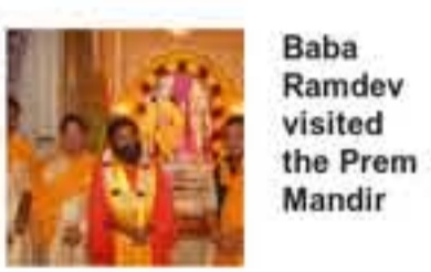
Baba Ramdev visited the Prem Mandir