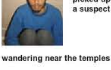
Police picked up a suspect wandering near the temples