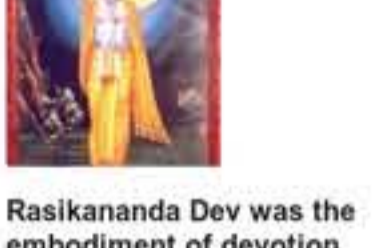
Rasikananda Dev was the embodiment of devotion