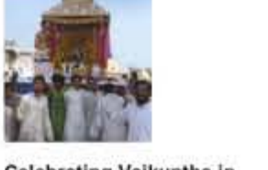
Celebrating Vaikuntha in Vrindavan – Bramhotsava begins