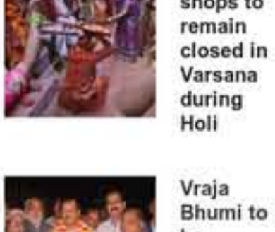
Liquor shops to remain closed in Varsana during Holi