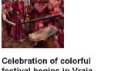
Celebration of colorful festival begins in Vraja