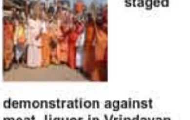
Saints staged demonstration against meat, liquor in Vrindavan