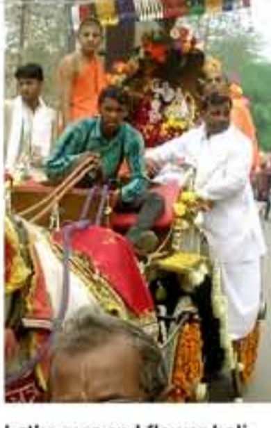
Latha mar and flower holi celebrated in Radha Govinda Mandir