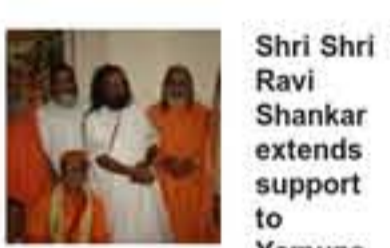
Shri Shri Ravi Shankar extends support to Yamuna Campaign