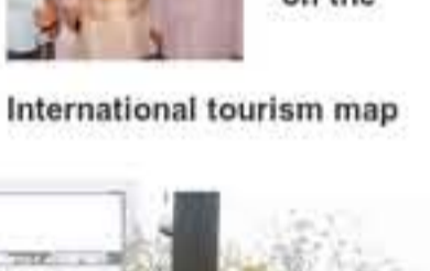
Vraja Bhumi to be brought on the International tourism map