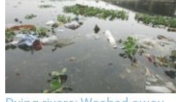
Dying rivers: Washed away by our sins In "Environment"