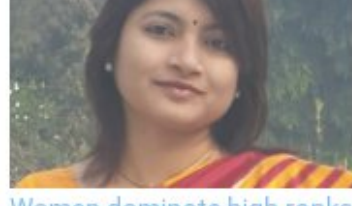
Women dominate high ranks of Mathura administration In "Politics"