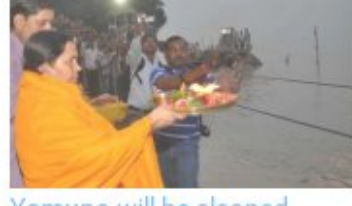
Yamuna will be cleaned before Ganga: Uma Bharti In "Environment"