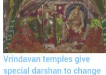
Vrindavan temples give special darshan to change deities' "swinging mood" In "Feature Articles"