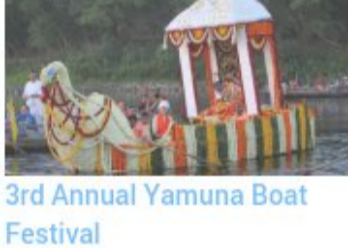
3rd Annual Yamuna Boat Festival In "Culture"