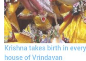
Krishna takes birth in every house of Vrindavan In "Festivals"

FILED UNDER: CULTURE, FEATURE ARTICLES, TEMPLE ACTIVITIES